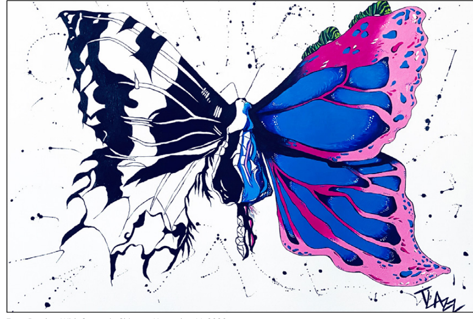
From Brushes With Cancer in Chicago, November 14, 2020.