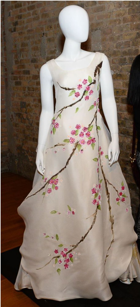
Brushes With Cancer in Chicago, November 2, 2019.