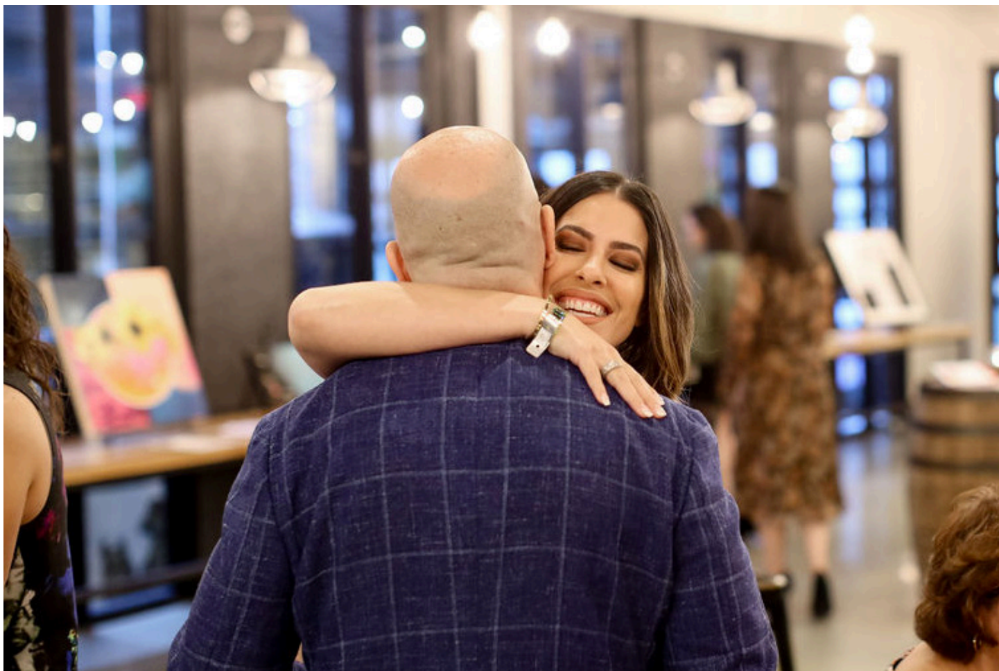
Brushes With Cancer in Philadelphia, September 18, 2019.