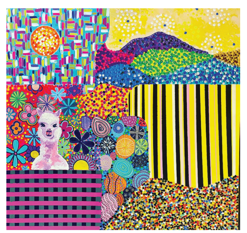
These three images are works created from Brushes with Cancer Midwest 2022.

On May 1, Southern Brushes with Cancer participants and supporters gathered at Dripping Springs Distilling in Texas for the 2022 Brushes with Cancer Celebration and Arts Exhibition. This marked the first in-person Brushes with Cancer event in more than two years and attracted over 300 in-person and 100 virtual attendees, celebrating connections between the 35 Inspirations and 35 Artists.